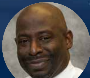
CHAIR Connected Leaders Move Faster