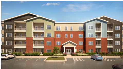
Forest Park Apartments District 3 7140 Forest Point Boulevard NRP Group TYPE: 4% LIHTC / Family