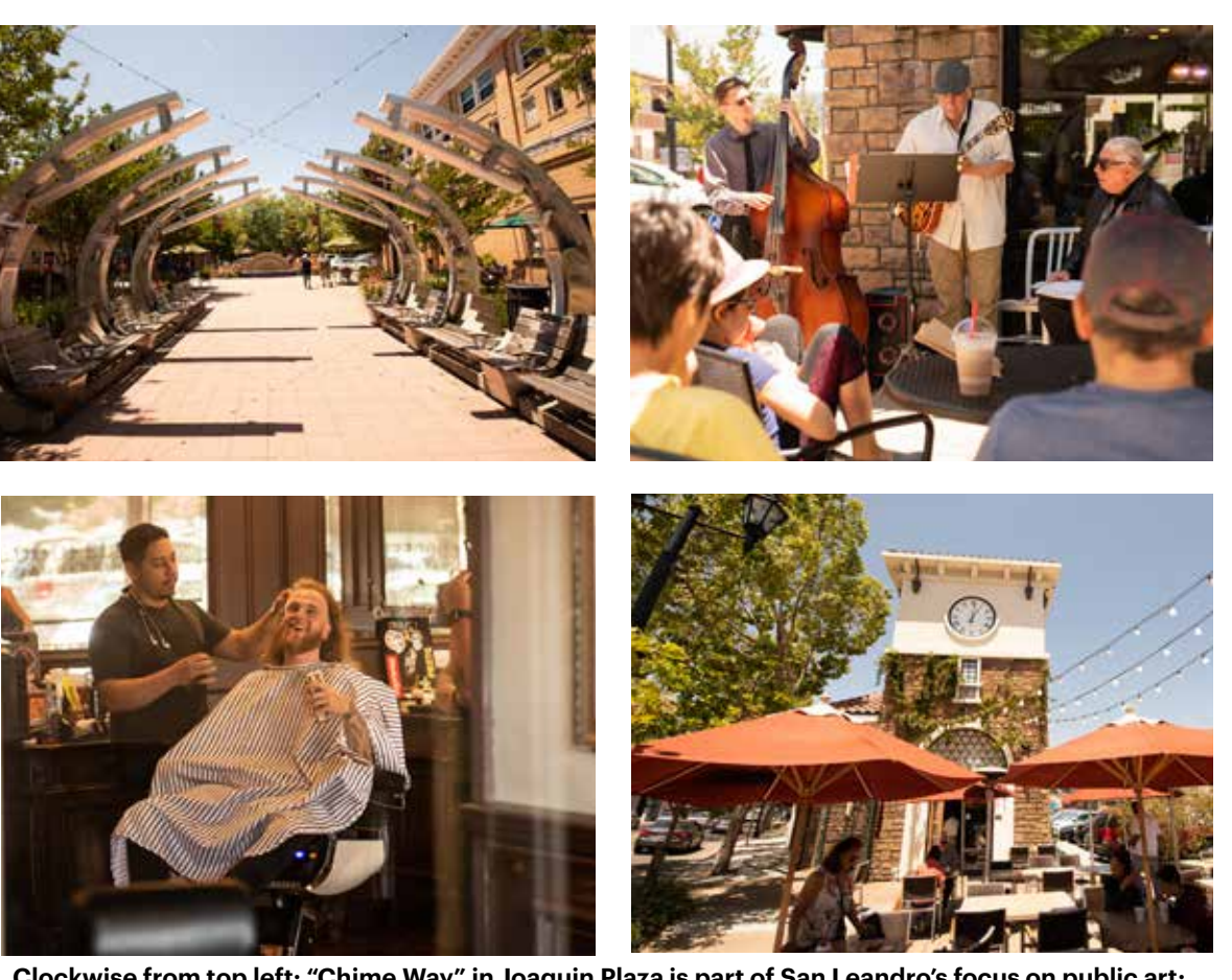
Clockwise from top left: "Chime Way" in Joaquin Plaza is part of San Leandro's focus on public art; street musicians play at the 2019 Cherry Festival; a clocktower is the focal point for downtown's walkable restaurants and shopping ; a patron enjoys a trim at Goodfellas barbershop, one of many services in downtown San Leandro.

Other developers followed. Westlake Urban built the Tech Campus. Maximus Real Estate Partners is building a 687-unit apartment complex on mostly vacant land on Alvarado Street. The project calls for replacing the adjacent Filarmonica Artista Amadora de San Leandro Music Conservatory with a 4,300-square-foot conservatory across the street—a plan to integrate the new development with existing city institutions and show deference