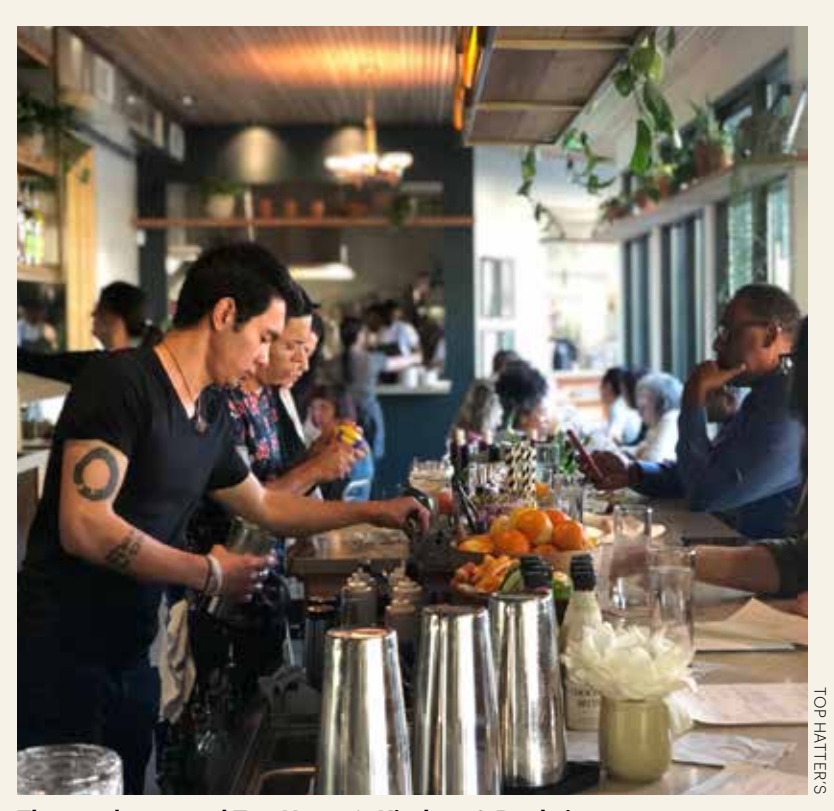
The newly opened Top Hatter's Kitchen & Bar brings contemporary chef-driven, pan-ethnic cuisine and craft cocktails to San Leandro.

*Featured on KQED's "Check, Please! Bay Area"