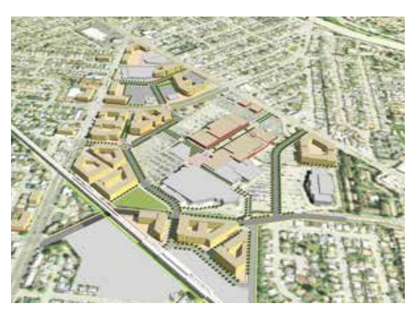
Conceptual Bay Fair Plan area development scenario.

It's a model that is at once a mobility plan, a housing solution with market-rate and affordable offerings, and, with its low-carbon, transit-oriented design, a climate-action strategy. BART and AC transit lines on East 14th Street will connect with first- and last-mile solutions, like bike rentals and bike racks, to get people between home