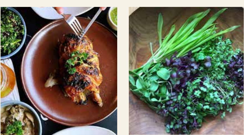
Grilled chicken from Papaito's Rotisserie and microgreens from Top Hatter's.

CINCO TACO BAR Diners really can't go wrong with any of San Leandro's numerous authentic Mexican cuisine options. Cinco Taco Bar is notable for its hand-pressed, fresh-daily tortillas and contemporary, streetfood vibe. 15100 Hesperian Blvd., Suite 308a