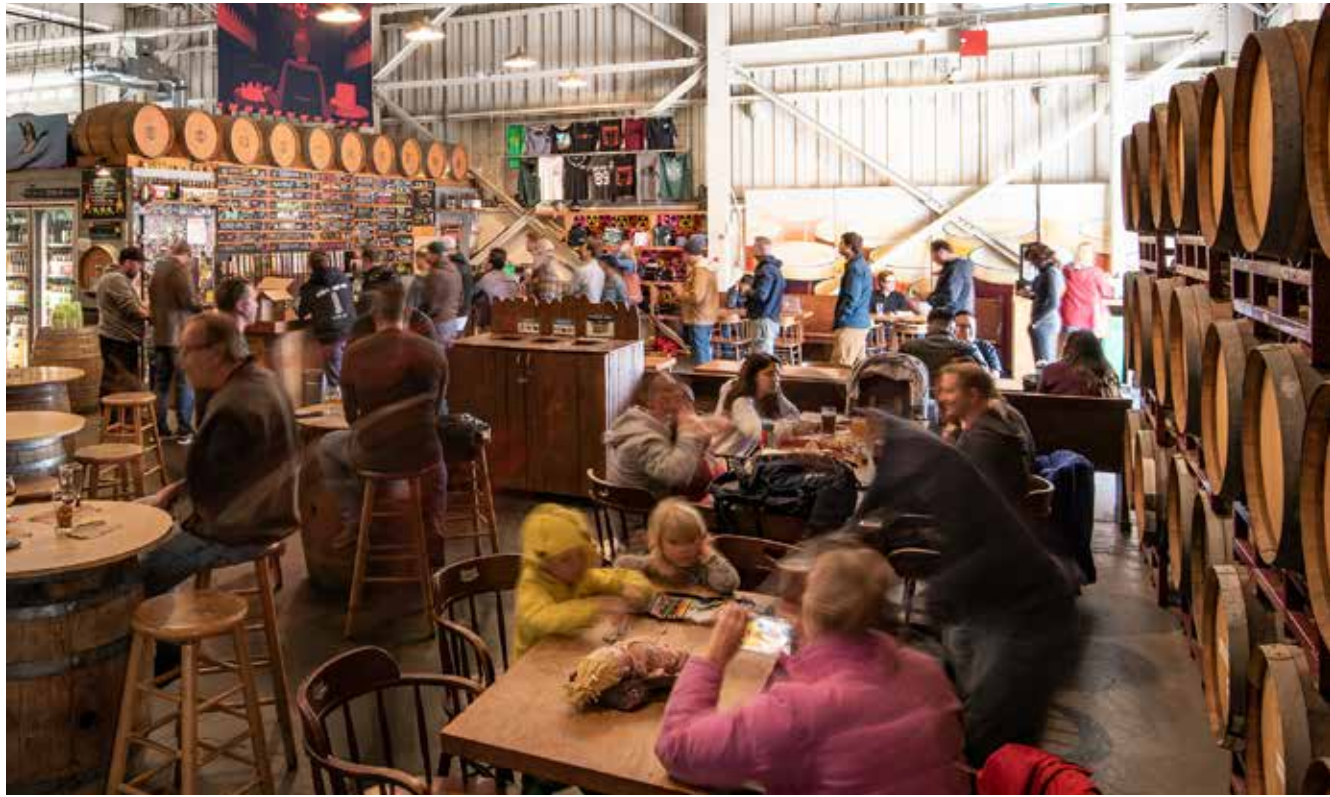
Drake's Barrel House offers a rotating selection of up to 22 beers on tap.

The brewers extended the manufacturing spirit when they established the Tap Room in 2015. White-oak crates