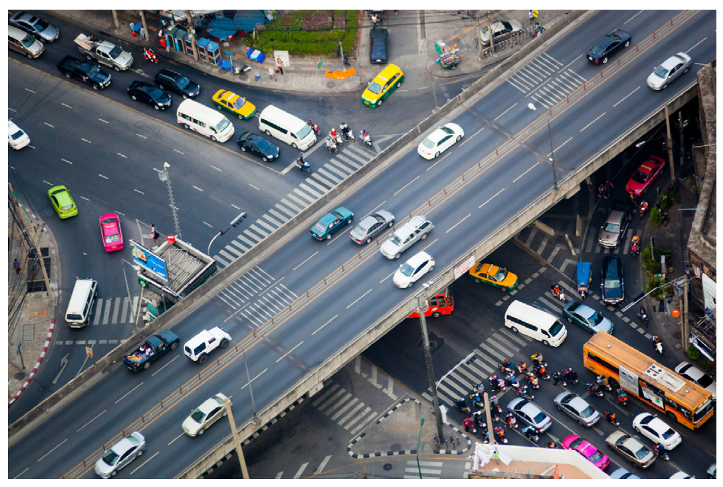
INRIX RESEARCH | INTELLIGENCE THAT MOVES THE WORLD

Three other New York corridors fill out the top 10. Surprisingly, Los Angeles, with the top spot in terms of peak hours sitting in congestion, only holds one spot on the list – I-10 Eastbound between I-405 and I-110. San Francisco, the third highest ranking city in the US for peak time spent in congestion, does not appear on the US worst corridors list until number 31.