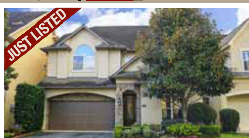
7615 E Jordan Cove · Spring Branch

Lovely 3 story 4 bdrm, 3.5 bath home. Wonderful floor plan w/generous room sizes. Gracious formals, hardwoods & double crown molding. Gourmet kitchen w/SS apps inclu gas range. Spacious den w/gas log fireplace & French doors to fabulous backyard. Hunters Creek Elem, SB Middle & Memorial HS.