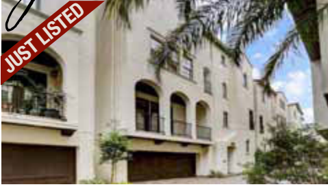
1700 Sunset D · Rice/Museum District Area Sophisticated 4 story 3 bdrm, 3.5 bath home nestled in private gated community. Wonderful floor plan w/generous room sizes & elevator. Very lightly lived in. Gourmet kitchen w/Miele appliances & center island w/breakfast bar. High ceilings + hardwoods. Lux master suite w/balcony. Huge 4th floor gamerm w/wet bar.