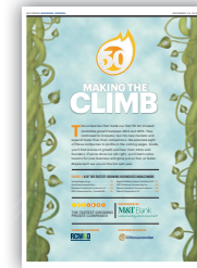
Fast 50 In-Paper Special