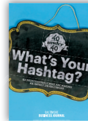
40 Under 40