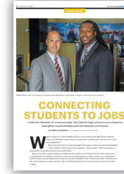
Diversity: Expand Your Circles In-Paper Special