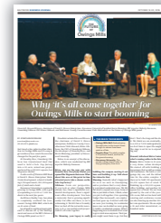
Future of... In-Paper Report