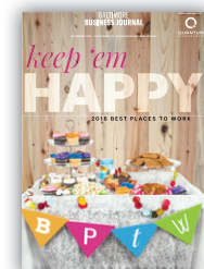
Best Places to Work