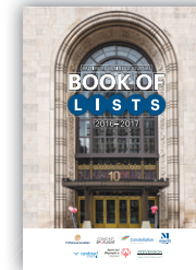
Book of Lists