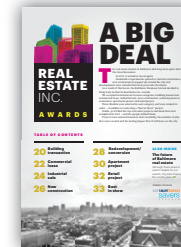
RE Inc. Top Projects In-Paper Special