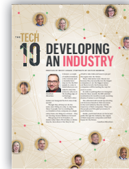
Tech 10 In-Paper Special