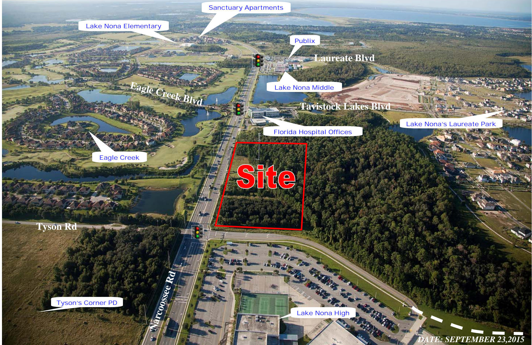
SWC Narcoossee Rd & Tyson Rd Orlando, FL