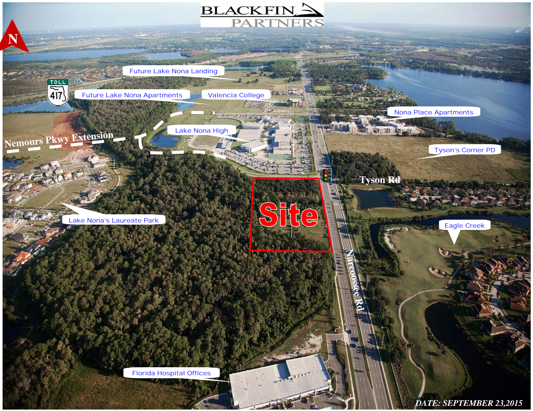
SWC Narcoossee Rd & Tyson Rd Orlando, FL