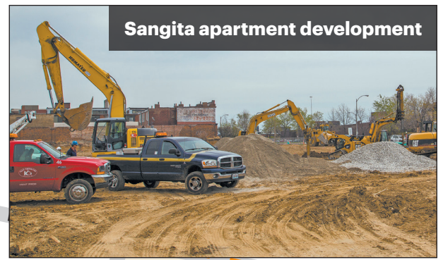
Sangita apartment development