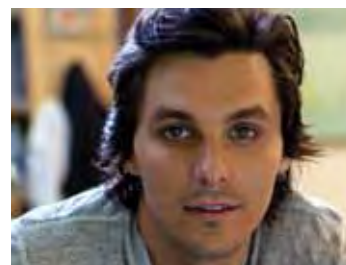
11:00 p.m. Charlie Worsham