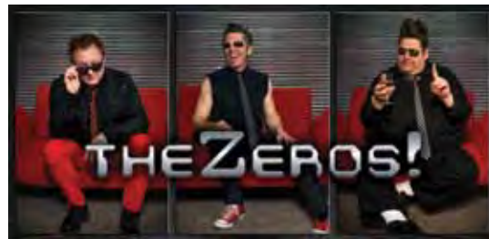
9:00 p.m. The Zeros