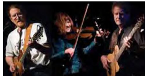
6:00 p.m. Rock, Paper, Scissors