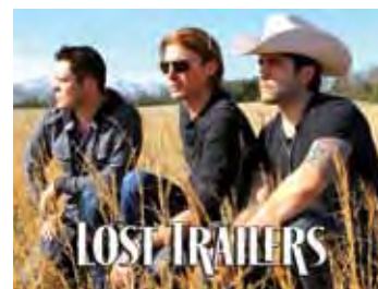
9:15 p.m. The Lost Trailers